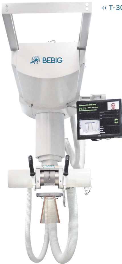
« T-300 ceiling suspension